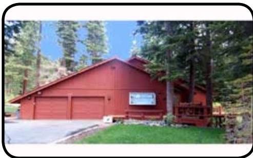
800 Geraldine Drive $788,500 - List