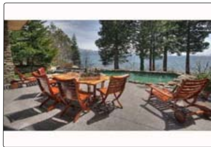
585 Lakeshore Blvd. $34,000,000