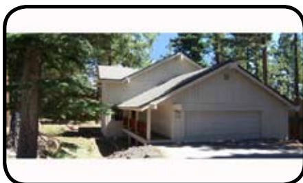
928 Dorcey Drive $595,000 - List $520,000- Sold