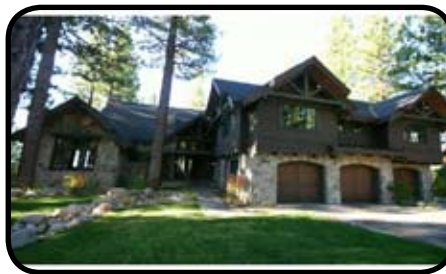
527 Sugarpine Drive $3,495,000 - List $2,607,950- Sold