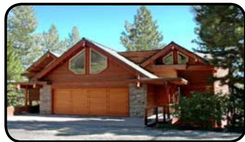
543 Knotty Pine $1,950,000 - List