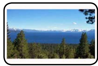
758 Tyner Way $2,495,000 List $2,005,000- Sold