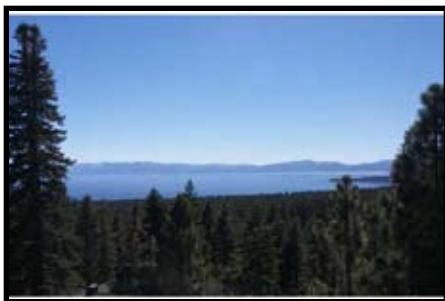
687 Cristina Drive $1,850,000