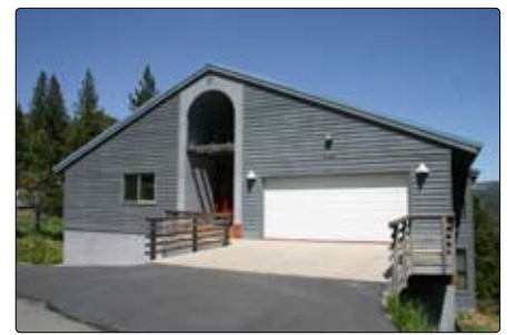
986 Dorcey Drive $1,200,000